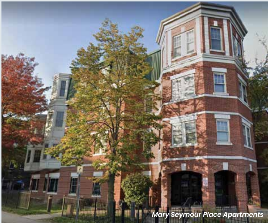
Mary Seymour Place Apartments