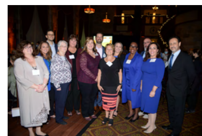
CHA Board of Directors and Executive Leadership at our 3rd Annual Hope and Home Celebration.

Program at My Sisters' Place. Visit hopeandhomet.com for more information. ■